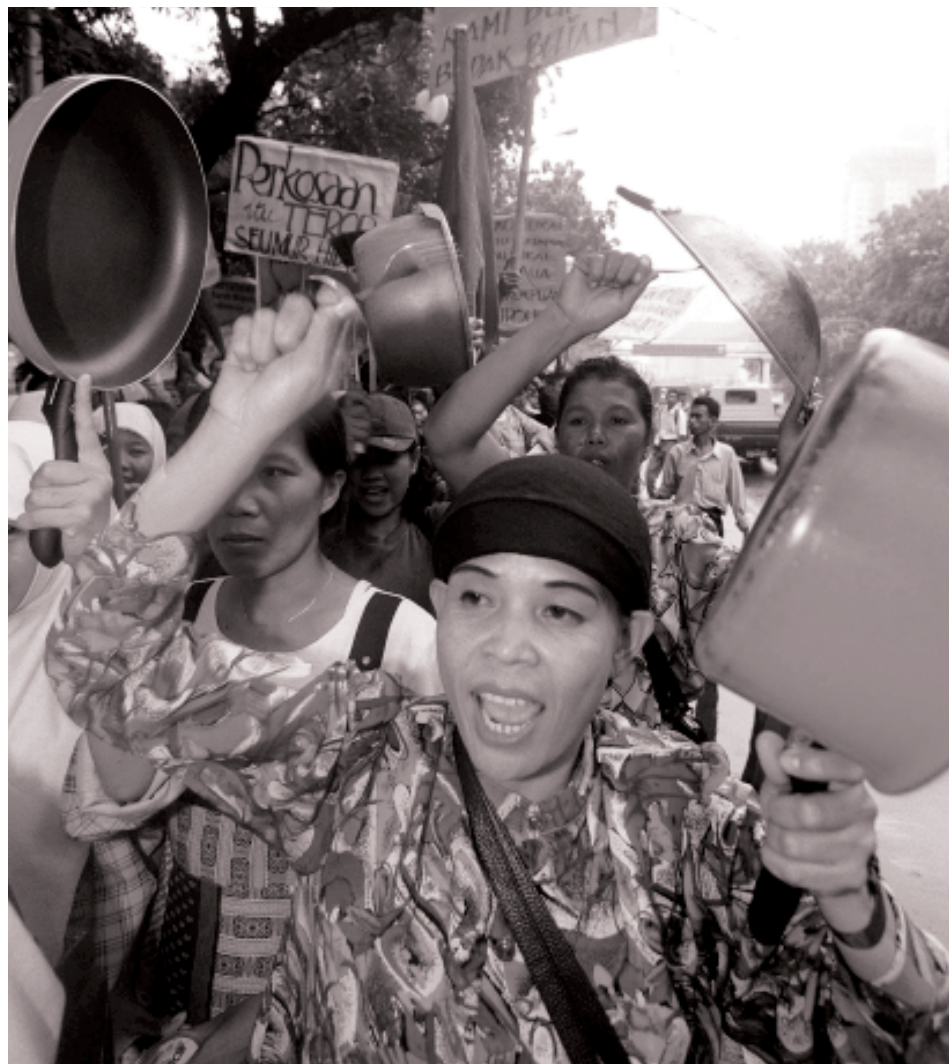
Women migrant workers demonstrate in Jakarta, Indonesia. New language editions of the IDEA Handbook Women in Parliament include Bahasa Indonesia.